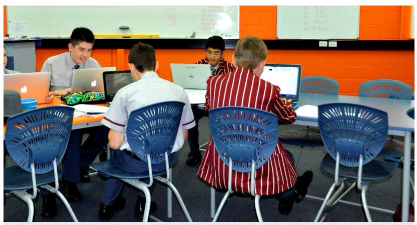
The Freeville Table system can be easily joined or separated depending on the task.