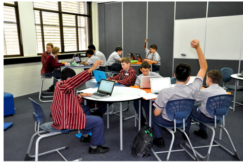
Varying height tables allow students to work where they are most comfortable.