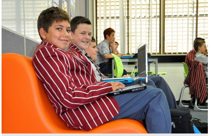
Comfortable \ soft \ seating \ options \ are \ popular \ with \ students.