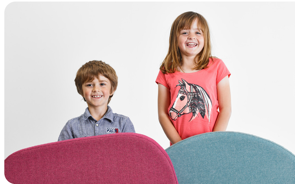
Use Spacemakers™ to easily and creatively divide spaces.

As has been highlighted by the government and educators, 1-meter distances between students may not be achievable in many classrooms due to space restrictions. The most workable solution is to reconfigure your space to support multiple 'moist breath zones', where students aren't breathing on or touching each other.