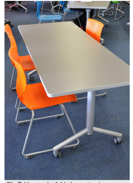
Flip Tables can be folded away to give more flexibility in the space.