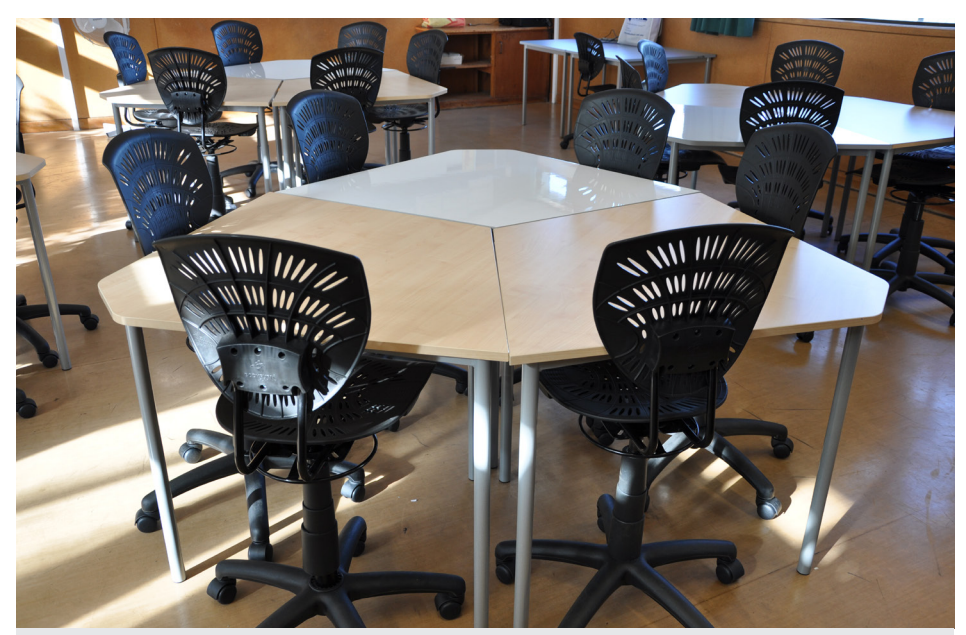
Business studies students can collaborate or learn independently.

"Although the spaces are still old, the new furniture has improved the feel of the rooms. Students and staff are most appreciative and enjoying the new spaces."