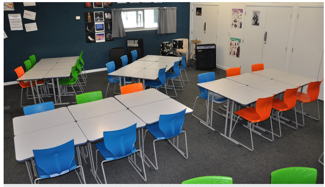
Connect Chairs in vibrant colours with Alpha Desks. The desks can be brought together for group learning, or separated for individual tasks.