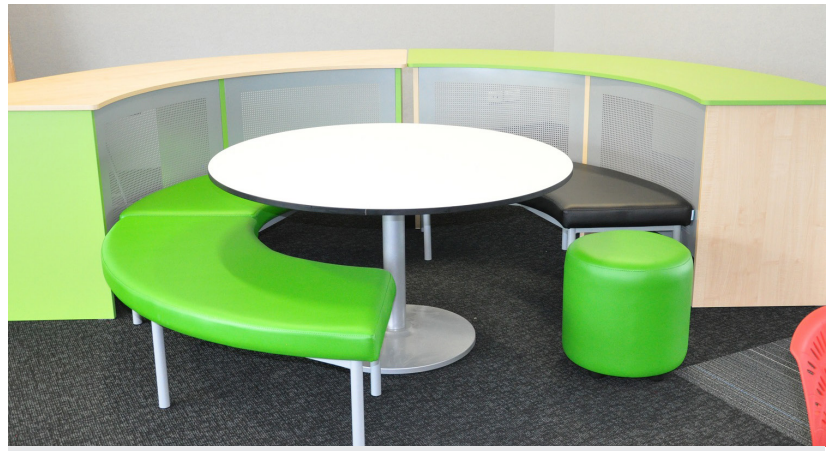
Endeavour Tables with Splice Ottomans and a Whiteboard Table make a colour splash.

"I never got a sense that it was just about selling furniture. It was always about creating an amazing modern learning environment which will service the needs of all learners in our school; now and in the future."