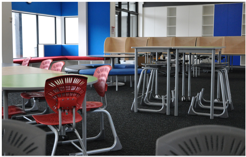
Study Carrels give students an area to work quietly and independently when the task