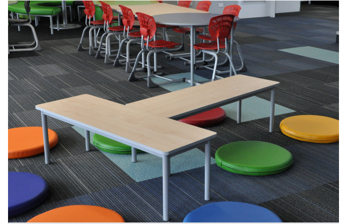
Younger students enjoy sitting on Cookie Pads around a Kneeler Table.