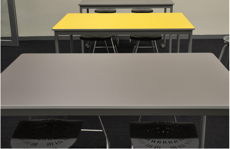
Rectangle Tables on castors are easy to move around the classroom to suit the task at hand.

"the lecture theatre was old and tired, the new space needed colour and vibrancy."