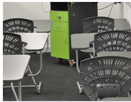
Pops of bright colour are great with the grey Bodyfurn® Sled Chairs.