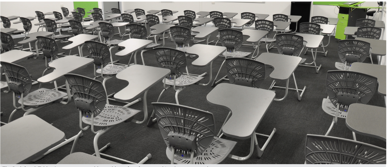
The Bodyfurn® Tablet Arm creates a stable, usable surface for note taking, laptop use and exams.