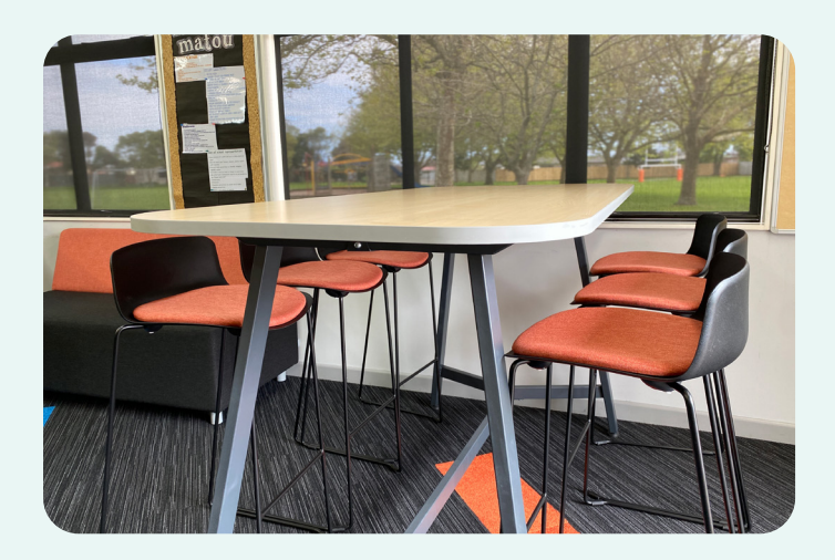
Gather High Table and Ascend Bar Stools